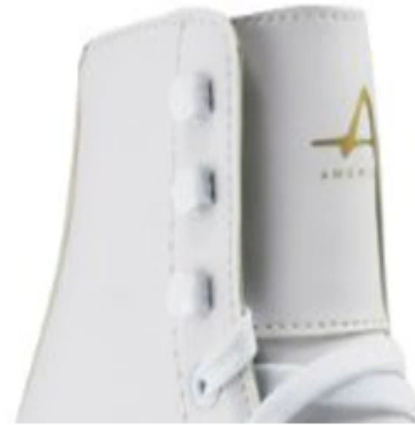
American Athletic Shoe Girl's Tricot Lined Ice